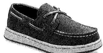
21. Sperry Cup