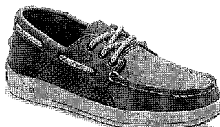
20. Sperry Gamefish