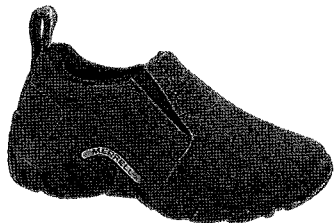
15. Brown Jungle Moc 15B. Black Leather Jungle Moc