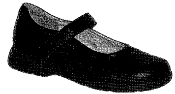
12. Black Leather