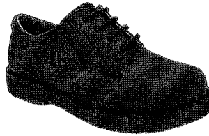
5. Black Nu Buck 5B. Brown Nu Buck