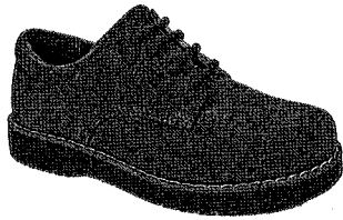
4. Tan Suede Buck