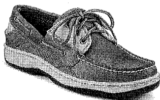
19. Sperry Billfish