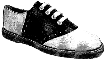
8. Black & White Saddle