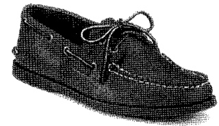
18. Sperry A/O (Authentic Original)