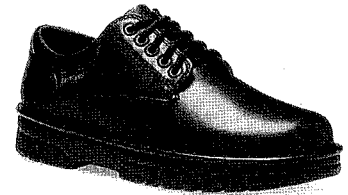
6. Brown Leather 7. Black Leather