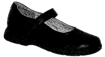
12. Black Leather