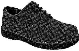
4. Tan Suede Buck