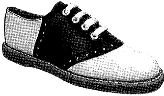
8. Black & White Saddle