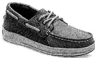
20. Sperry Gamefish