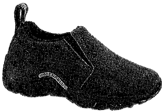
15. Brown Jungle Moc 15B. Black Leather Jungle Moc