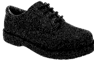
5. Black Nu Buck 5B. Brown Nu Buck