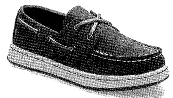
21. Sperry Cup