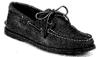
18. Sperry A/O (Authentic Original)