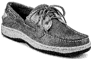
19. Sperry Billfish