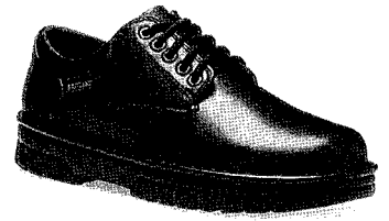
6. Brown Leather 7. Black Leather