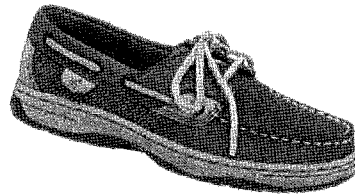
17. Sperry Bluefish 17B. Sperry Koifish