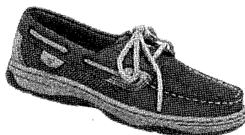
17. Sperry Bluefish 17B. Sperry Koifish