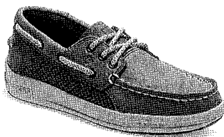
20. Sperry Gamefish