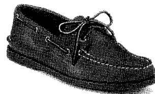
18. Sperry A/O (Authentic Original)