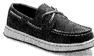
21. Sperry Cup