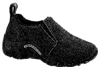
15. Brown Jungle Moc 15B. Black Leather Jungle Moc