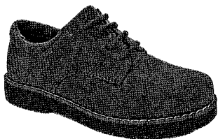
4. Tan Suede Buck