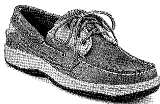
19. Sperry Billfish