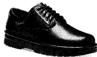
6. Brown Leather 7. Black Leather