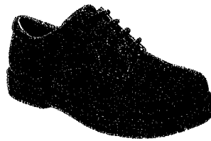
5. Black Nu Buck 5B. Brown Nu Buck