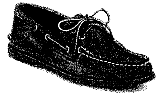
18. Sperry A/O (Authentic Original)