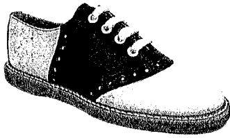
8. Black & White Saddle