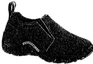
15. Brown Jungle Moc 15B. Black Leather Jungle Moc