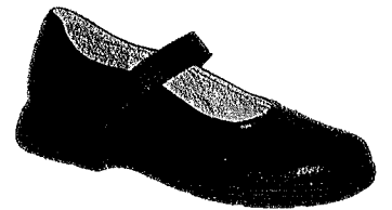
12. Black Leather