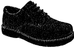
4. Tan Suede Buck