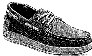
20. Sperry Gamefish