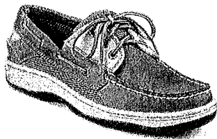
19. Sperry Billfish