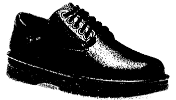
6. Brown Leather 7. Black Leather