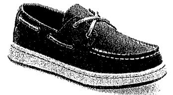
21. Sperry Cup